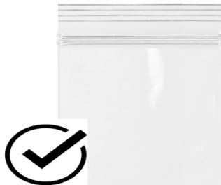
ONE (1) GALLON CLEAR PLASTIC STORAGE BAG