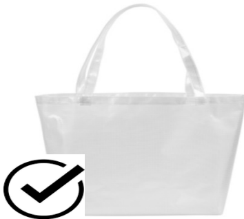
12" x 6" x 12" CLEAR TOTE (Larger sizes prohibited)