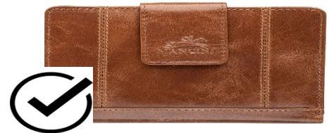
6.5" x 4.5" SMALL CLUTCH PURSE (Does not have to be clear)